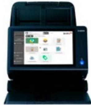
Scan2x on ScanFront