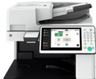
Scan2x on imageRUNNER