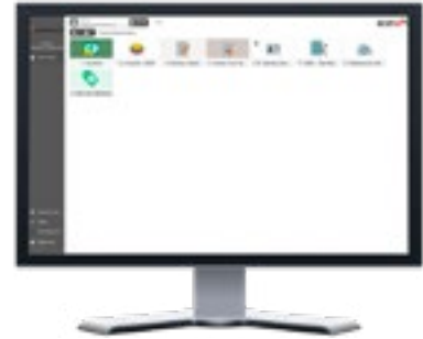
Scan2x on Windows